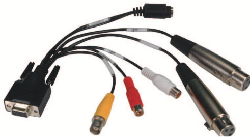
Input Breakout Cable